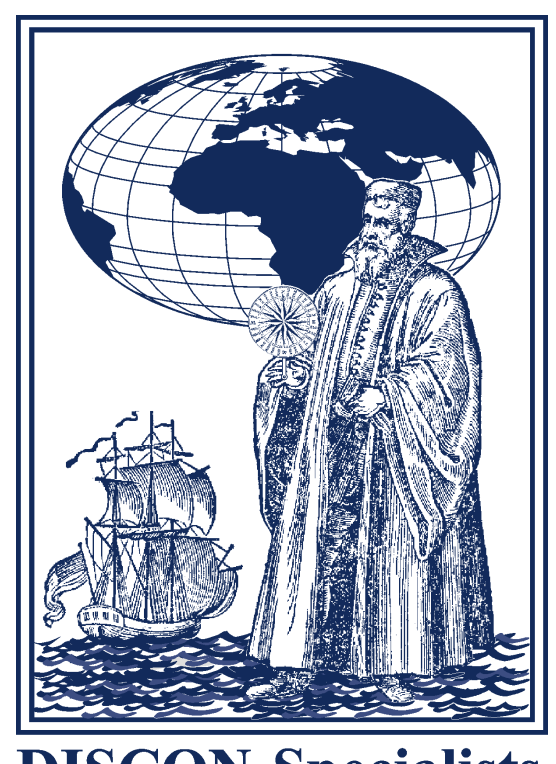
DISCON Specialists Architecting Business Solutions